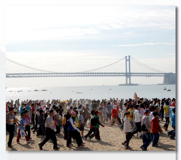
2008 Busan, Korea