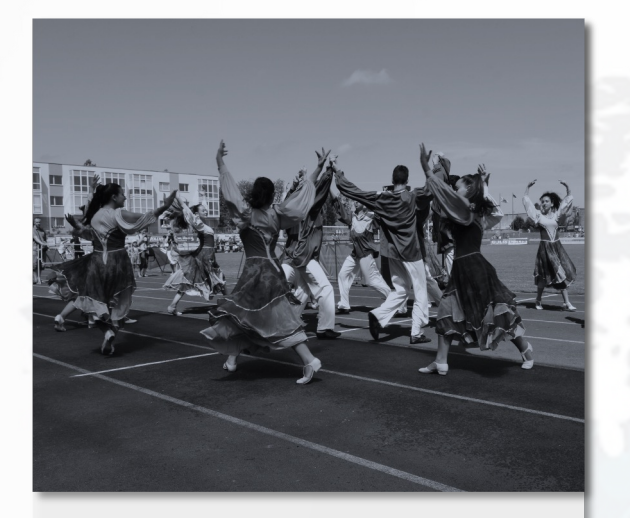
1991 Bonn, Germany