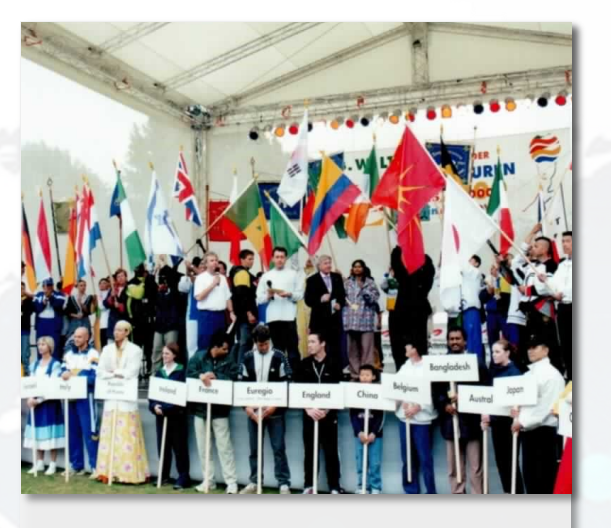
2000 Hannover, Germany