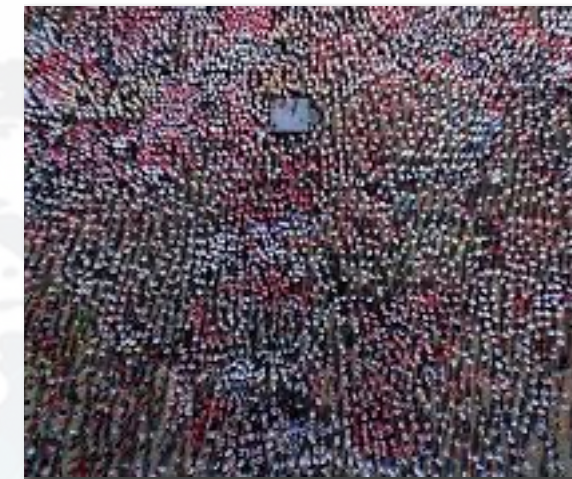
1996 Bangkok, Thailand