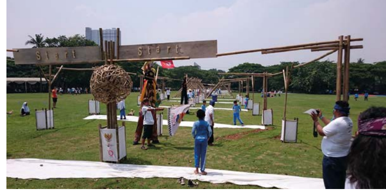
Traditional Indonesian Sports and Games Festival