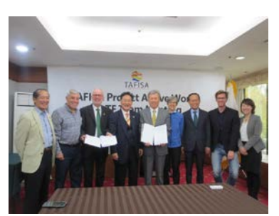
"The Signing Ceremony for the 25th TAFISA World Congress 2017 in Seoul, Korea: TAFISA and the host Sport for All Korea Association (SAKA).

TAFISA invites all its members, stakeholders, friends and Sport for All enthusiasts from around the globe to join us in creating an Active World 2030.