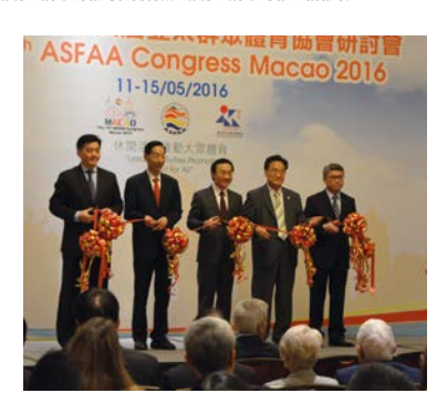
The 14th ASFAA Congress Opening Ceremon