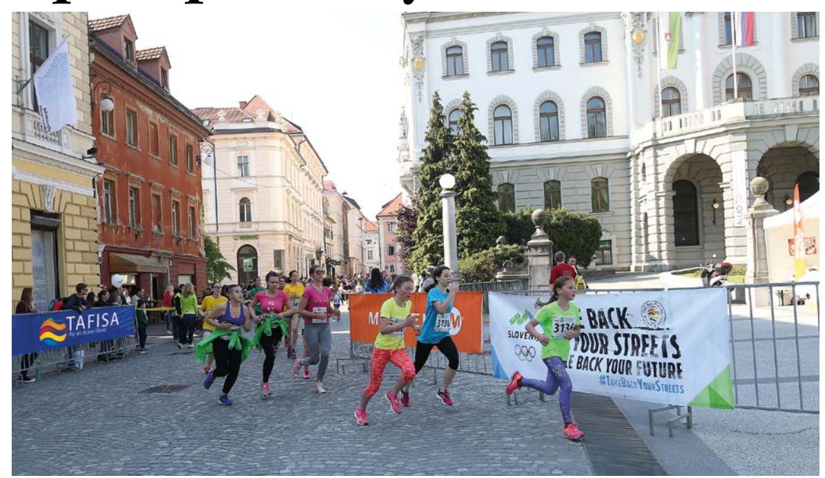
Take Back Your Streets event "60th March Along the Barbed Wire" in Ljubljana, Slovenia – May 5-7, 2016