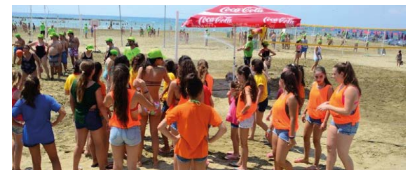
Cyprus Sports Activity Festival, Larnaca Beach, Cyprus – 20 July 2016

TAFISA is launching its official Sport for All calendar in the form of the Take Back Your Streets Calendar of Events to further share and promote good initiatives organized around the world. Register your event online at www.ta-fisa.org and be featured on the TAFISA website!