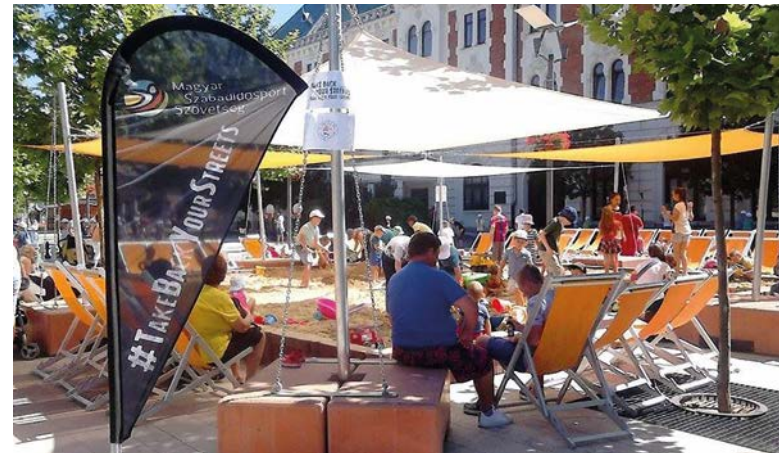
Giant Sandbox in Újpest (Budapest's 4th District), Hungary – June-August, 2016

Besides the official Flagship Events and TAFISA programs (World Challenge Day, World Walking Day and European Week of Sport #BeActive Challenge), other events joined the Take Back Your Streets... Take Back Your Future! program through the labelling system: