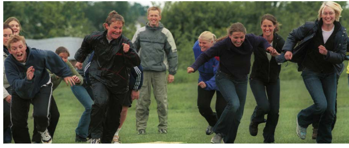
Gerlev Sports Academy, Denmark

Launched in September 2014 to safeguard, promote and help reintroduce TSG into the daily lives of people, the two TAFISA Regional TSG Centres located in the Gerlev Sports Academy, Denmark, and HVP Mandal. Amravati, India have shown steady