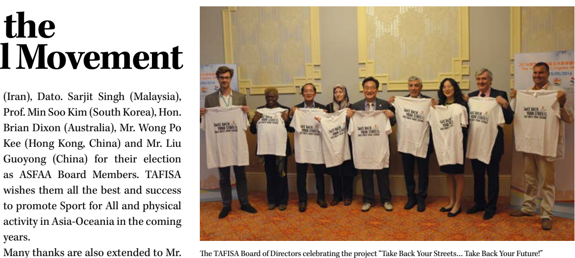
The TAFISA Board of Directors celebrating the project "Take Back Your Streets... Take Back Your Future!