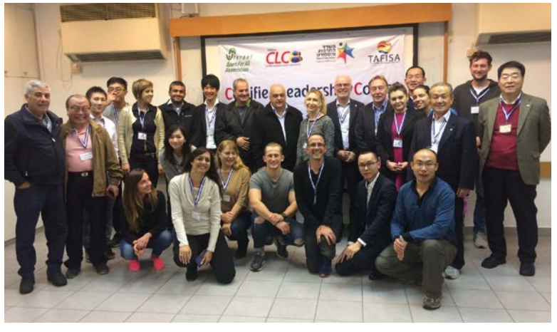
International CLC in Shefayim, Israel, November 29th - December 2nd