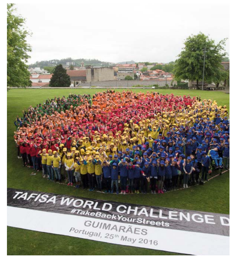
Guimaraes, Portugal, was elected best European City of Sport 2013 and exemplifies the Active Cities concept in Europe

For more information about TAFISA's work in Active Cities, or to register your event in the Take Back Your Streets program, visit www.tafisa.org