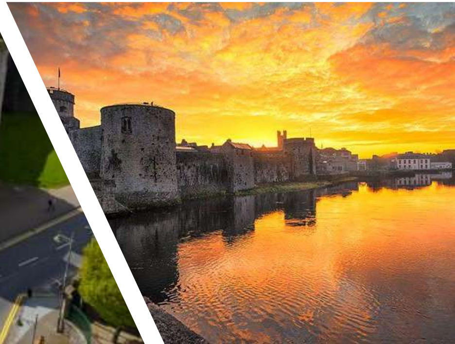
King John's Castle