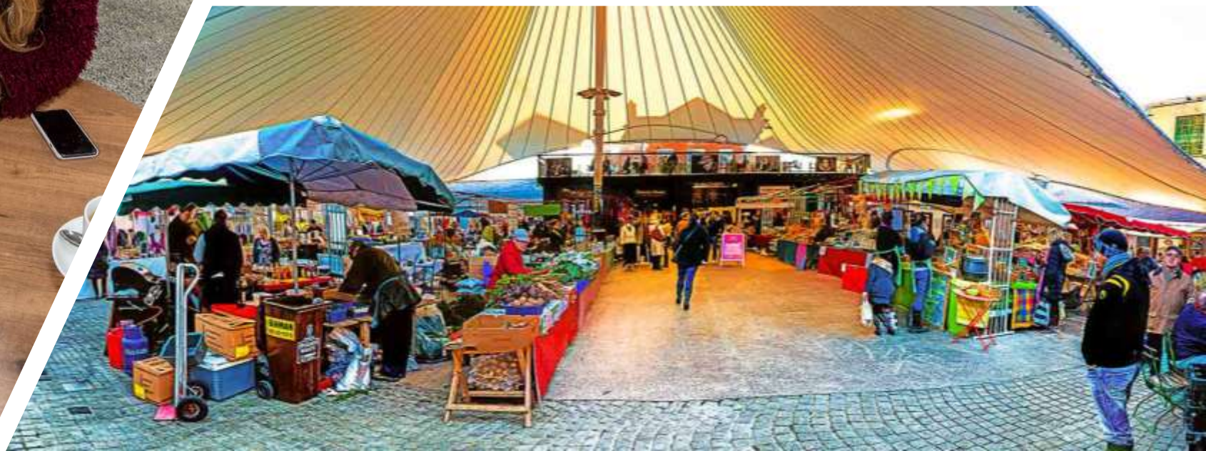
The Milk Market