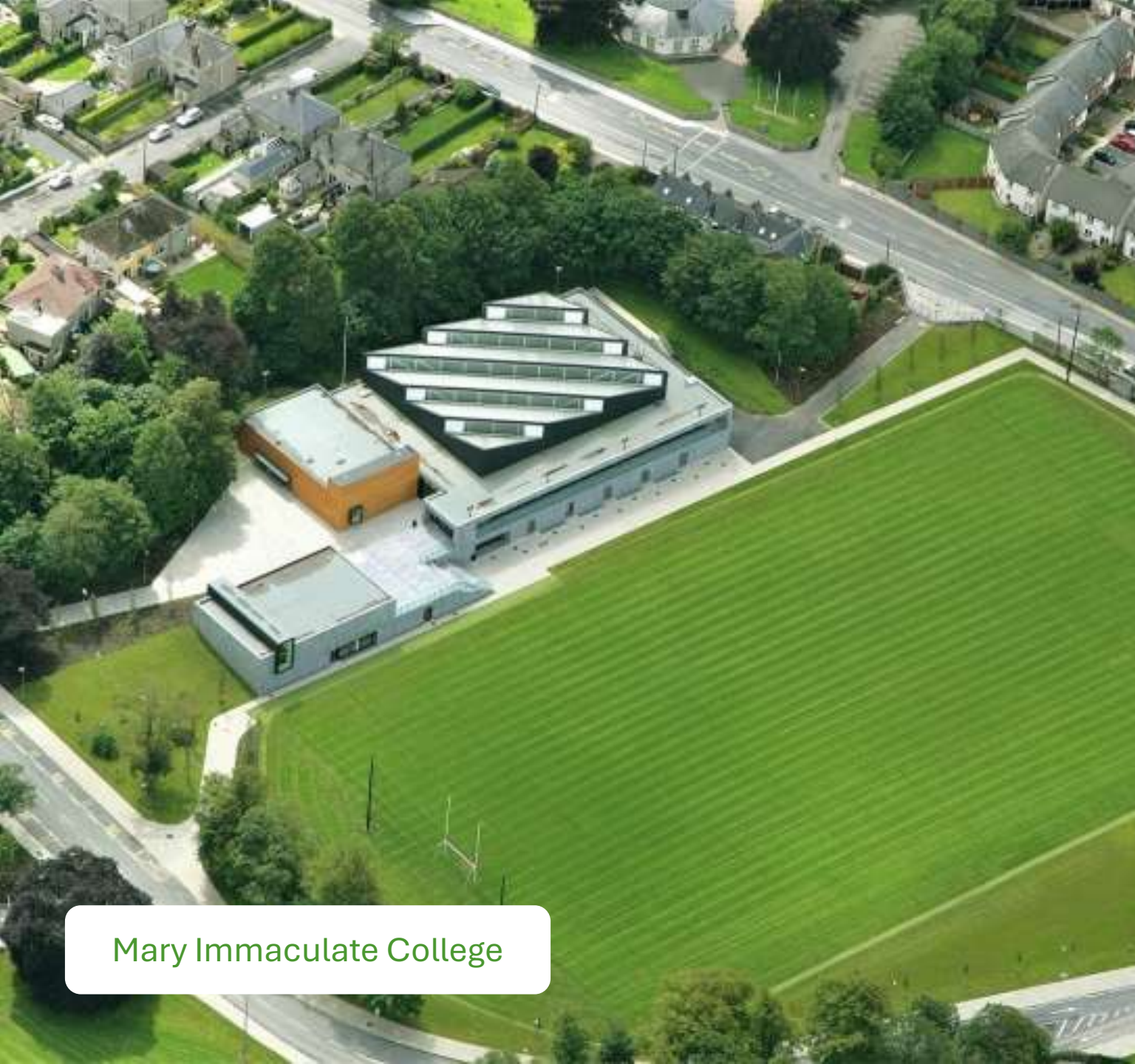
Mary Immaculate College